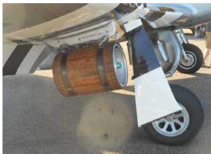
For a modest amount you would get a t-shirt, and a stainless embossed mug full of brew from either of these kegs. Check the shadow. He must have thought it would be good, too.