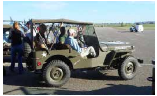
Lynn Aas riding with Rory Grenier