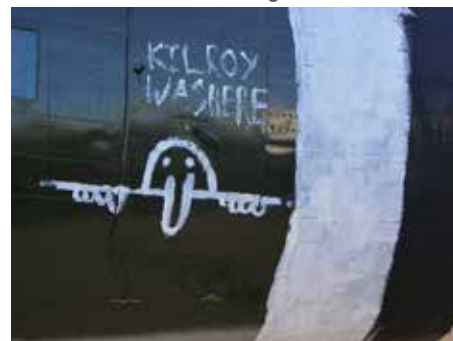
There's an interesting history to "KILROY Was Here." One of the strippers thought it fitting to show up Thursday. It was.