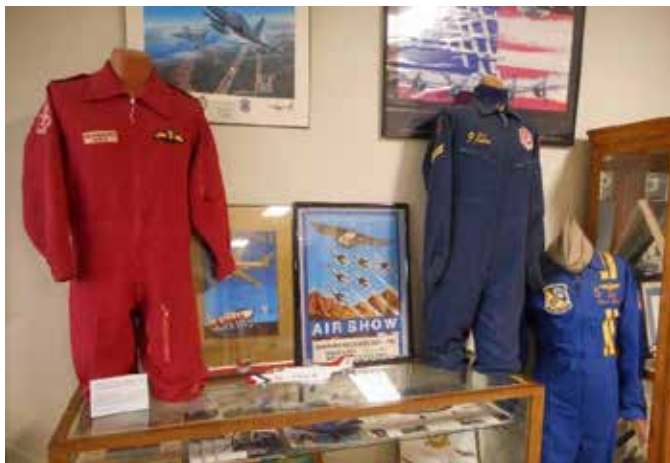
The Snowbirds, Thunderbirds, Blue Angels; the Snowbirds will be performing in the July 4th Airshow.

Remember when these two airlines served Minot? Frontier came and went; North Central is not the flying goose anymore but was absorbed into so many it finally serves as a history for Delta.