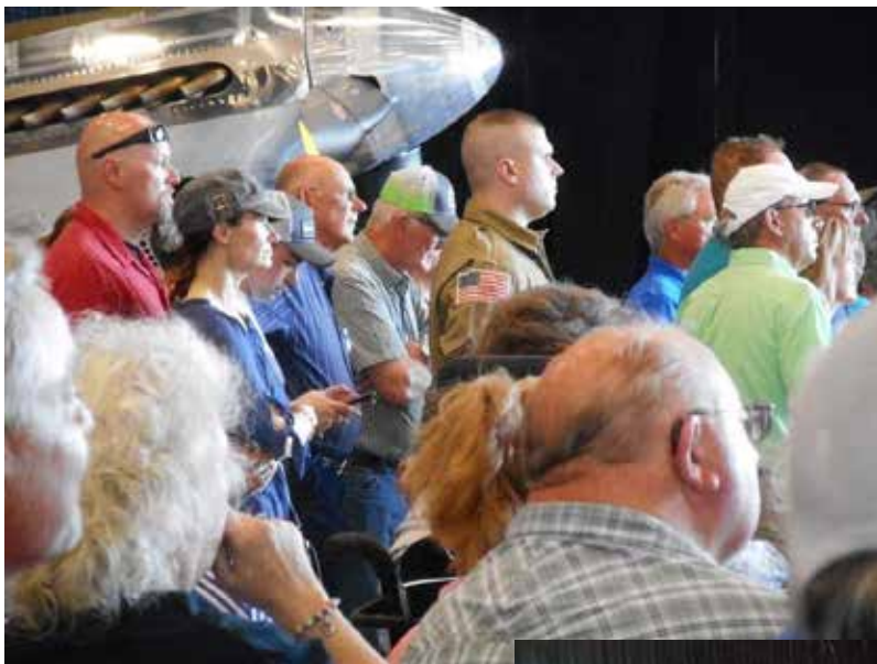
The Warbird Hangar was full with many standing. In the background is Lope's Hope II, a P51B.