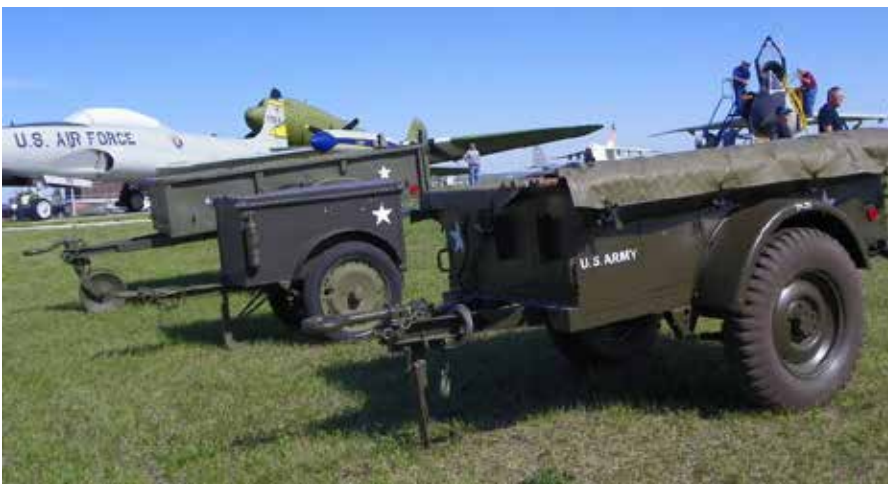
An assortment of military trailers as were used to haul supplies on D-Day. Part of the ND Military Vehicle Collector Association display.