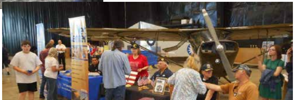
Members of the Vet Center were on hand to visit and offer help for veterans.