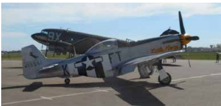
"Little Horse" P51D; Doouglas C47 Sky Trooper in background. Note: kegs not yet installed.