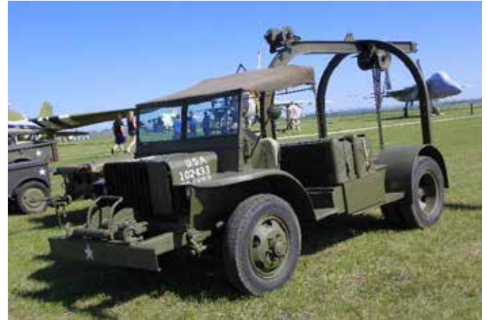
A 1942 Ford GTB Bomb Service truck brought by Lyle Torno