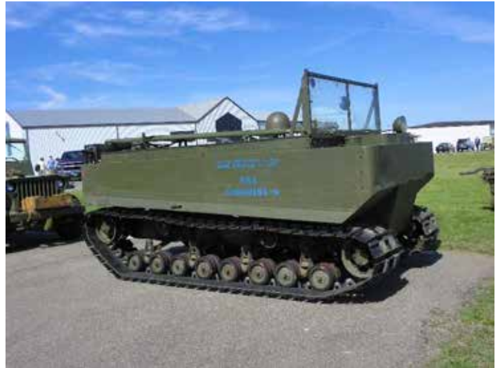
1943 Weasel used to carry wounded. Owned by Rory Grenier, Grand Forks.