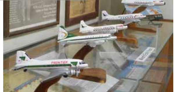
Models on display depicting Frontier and North Central Airlines