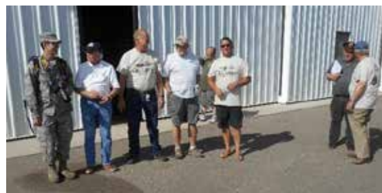
Just some important people standing around, visiting.