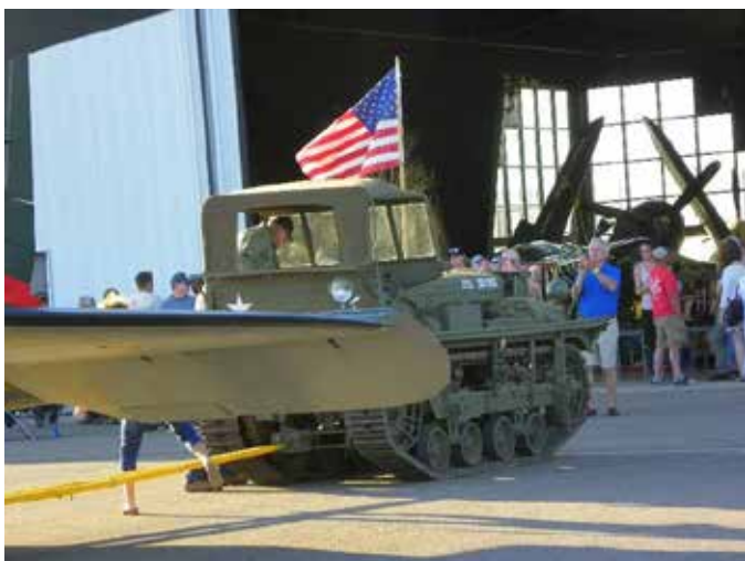
Johnny Benter was given the honor of tugging the C47 back to the hangar following his ride. His M2 Clerack is a fully tracked vehicle designed to tow aircraft on primitive airfields. It was equipped with a 10,000 lb winch with 300 ft cable, an auxiliary generator (3KW, 110 Volts, DC), and an air compressor (3 stage, 16.7 CFPM, 2,000 PSI.) This example was restored to perfection at his shop in Crosby.