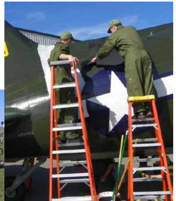
A group of volunteer Airmen from MAFB painting invasion stripes on the Sky Trooper. They were using finger paint that in this case would wash off easily.