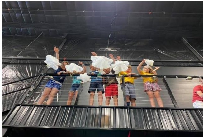
2021 ACE camp students learn about the science of parachutes

Registration is now open for two of the DTAM's best known aviation education camps, ACE and PACE. This year, ACE camps will be held on three different days: Friday, June 3, 2022 9am-noon, Tuesday, June 7, 2022 9am-noon, and Tuesday, June 28, 2022 9am-noon.