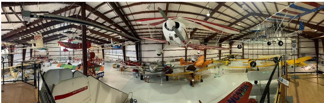
Above: Loft View of the Oswin Elker Memorial Wing.