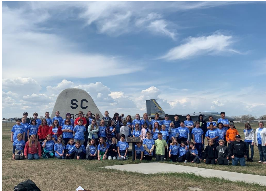
Above: Group of 6th graders from Stanley Public Schools visit the museum in Spring 2021.

We are very excited to welcome students and educators from around the state for FREE guided tours of our facilities. In 2021, we welcomed well over 500 students and educators for tours. If you, or anyone you know, would be interested in arranging a school group tour or an educational tour for your Girl/Boy Scout group, please contact the museum at 701-852-8500 or airmuseum@minot.com for more information.