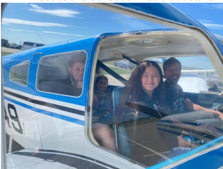
2021 PACE camp participants head out on their fly day.

There are more educational events being planned for this summer so stay tuned to our website and our social media outlets for further announcements and information!