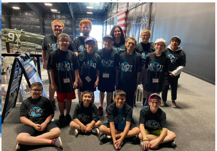
2021 PACE camp participants.