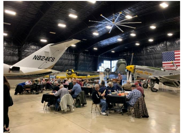
Above: Museum members attending the annual meeting.