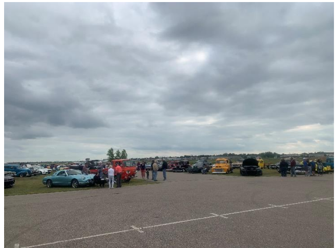
Photo Above: Over 150 vintage and classic vehicles with the Dakota Cruisers Car Club packed the museum grounds for Wings & Wheels on July 12, 2023.

Photo Above: The Night at the Museum Hangar Dance on October 21, 2023 proved once again to be a crowd favorite.