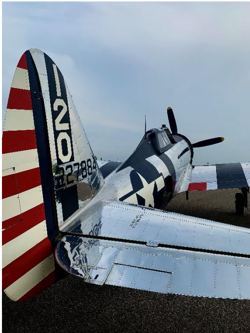
Photo Above: The P-47D Thunderbolt sits on the ramp after arrival to the DTAM at the Festival of Flight on June 17, 2023 for its first public outing.

2023 proved to be yet another year of growth for the museum's public events. With that in mind, we are very excited for what is in store in 2024! Look for a 2024 event schedule to be announced soon! We are always looking for new ideas and feedback so please reach out to us at airmuseum@minot.com or 701-852-8500 with your ideas and feedback on events!