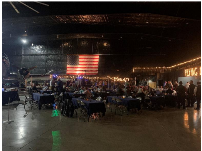
Photo Above: The Night at the Museum Hangar Dance on October 21, 2023 proved once again to be a crowd favorite.