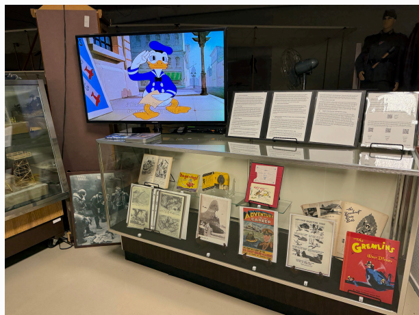
Photo: New exhibit featuring cartoons and their use in World War II.

2026 is sure to be a great year for a lot of reasons! We hope to see you at the museum this summer!